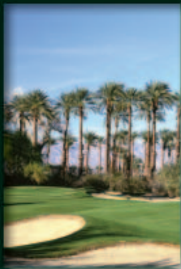
Hole # 3 401 yards, Par Four